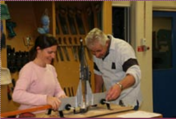
ACE – re-engaging adult learners in training and initiating pathways for further education and employment.