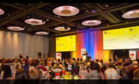
ACE Awards night