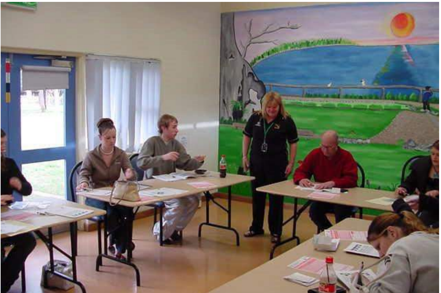
Using practical examples and model cars helps learners visualise.

'I'm proud of putting safer road users out on the road. And I've become a better driver myself.'