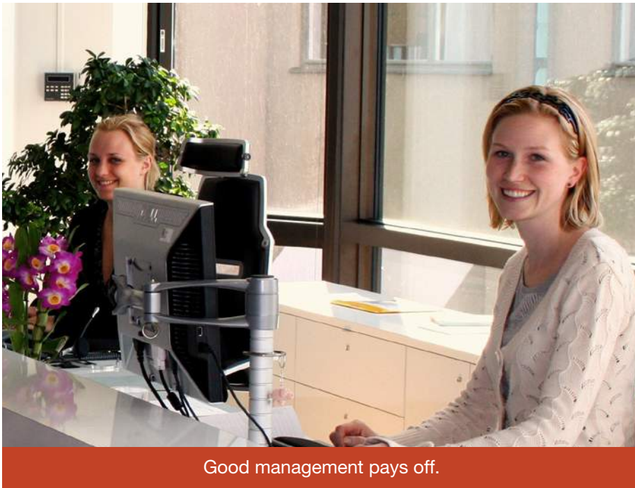
Good management pays off.

job and how the job's working for them. But staff need to feel that it's a useful exercise. Involve staff in the development of the process and the paperwork – which doesn't need to be complicated – and make sure they're happy with it.