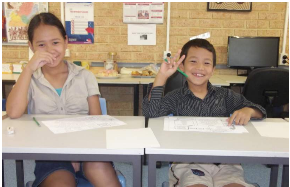
Kids do better at school.

Linkwest, the State Association for Community, Neighbourhood and Learning Centres, with funding from the Office of Multicultural Affairs, selected William Langford Community House as one of the four centres to run a pilot.