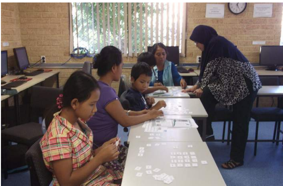
Parents and children learn together.

Finding a common language was also tricky, with people from Sri Lanka, Burma, India, China, Afghanistan and Sudan. 'Their English was very broken but halfway through they started to open up and make friends with other parents. Now they walk together from school to home and ask one another questions about homework.'