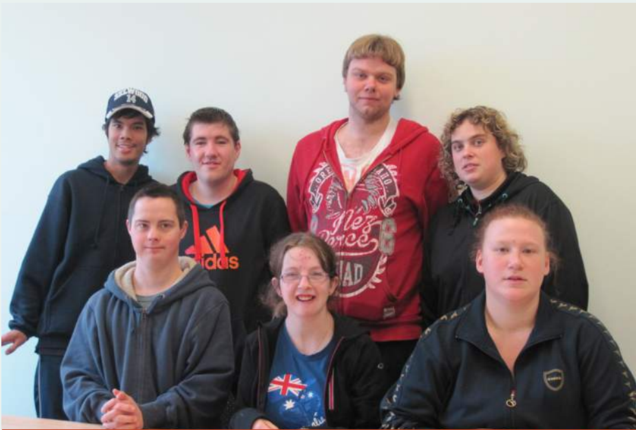
The 'All Abilities Essential Skills' for Work Group.

Organising and running an awards night for a 250-strong basketball team is no mean feat. But the gala event for the Doncaster All Abilities Basketball Competition went smoothly thanks to the behind-the-scenes work of a group of students at Pines Learning in Melbourne's Doncaster East.