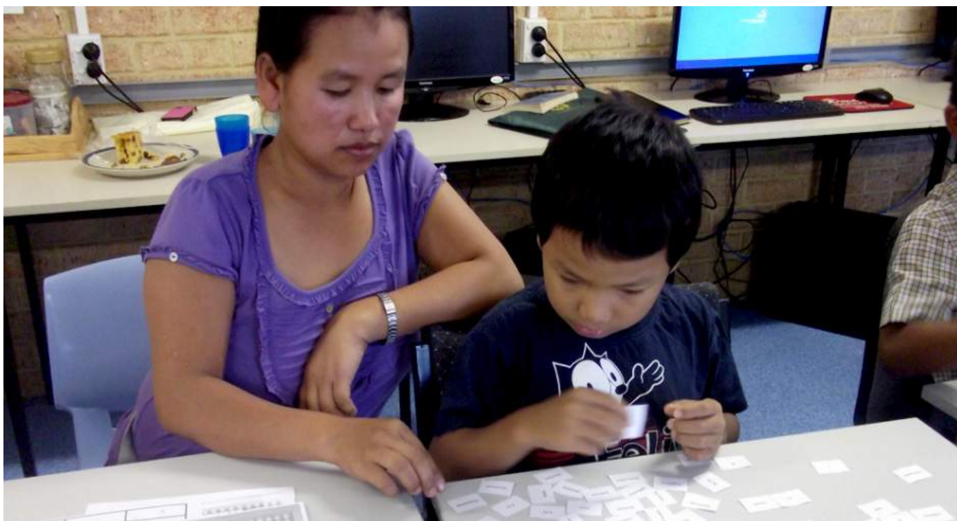
Helping with homework improves communication between parents and children.

After school on Mondays and Tuesdays, a group of families speaking any one of a number of languages – Tamil, Hindi, Arabic, Burmese – arrive for a two-hour class at the William Langford Community House in suburban Perth. The parents go to one room, the children go to another. They are part of a successful homework program involving refugee kids and their parents.