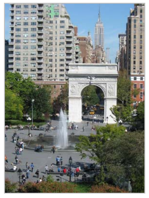
George Washington Park gate

'Down Under Centres' was presented by the Australian delegates. The participants were treated to clever graphics comparing the size of Australia to the USA and Europe.