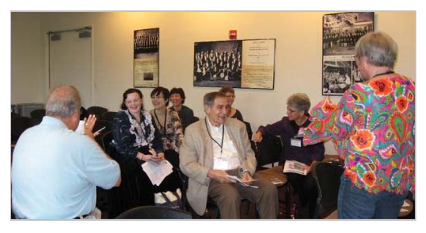
In the second row is a Romany woman from St Petersburg, Russia. Accompanied by an interpreter, she dressed in her national costume at the conference. She is a youth and family worker with a non-government organisation.