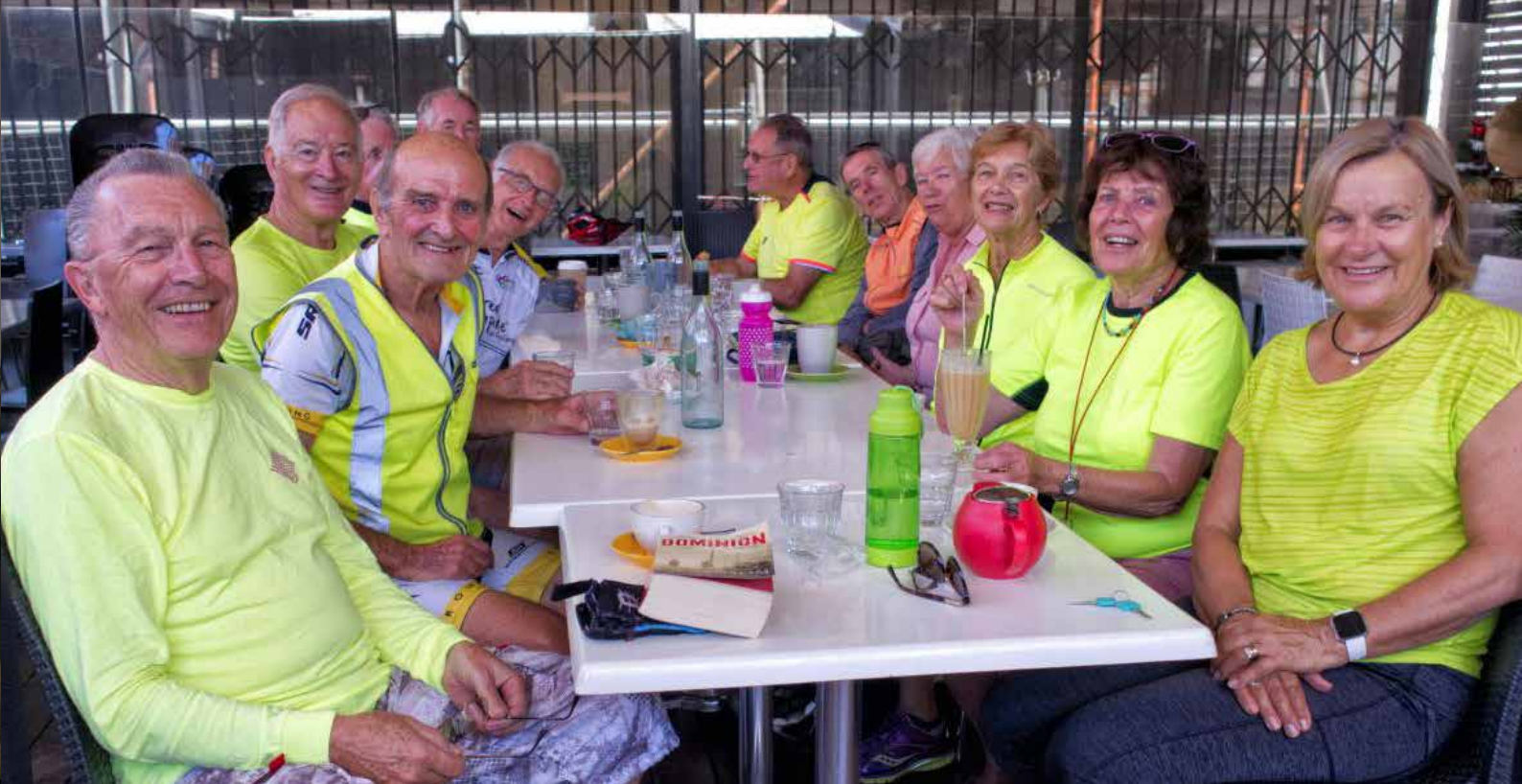
Glyde-In hosts a range of self-run groups including one for cyclists.

Outside of the formal program the Centre hosts a range of self-run groups that get together for activities and socialising including cycling and walking groups and groups who meet for scrabble, mah-jong, chess and music.