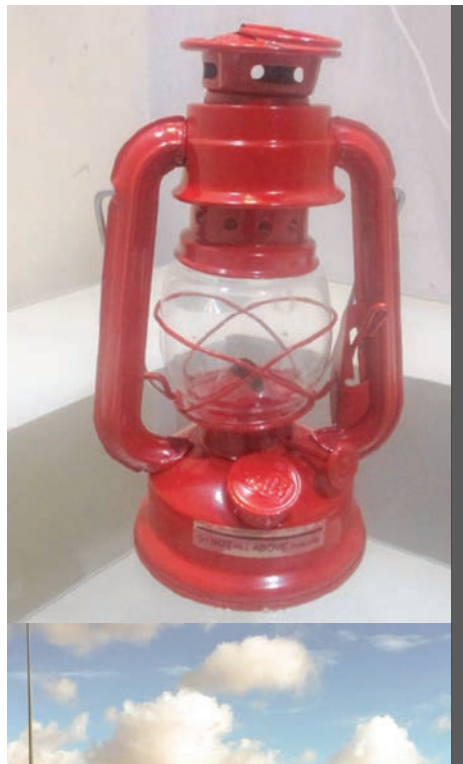
'Light makes me feel safe. War took all the light from our lives. We used this light to survive and hold us together.'