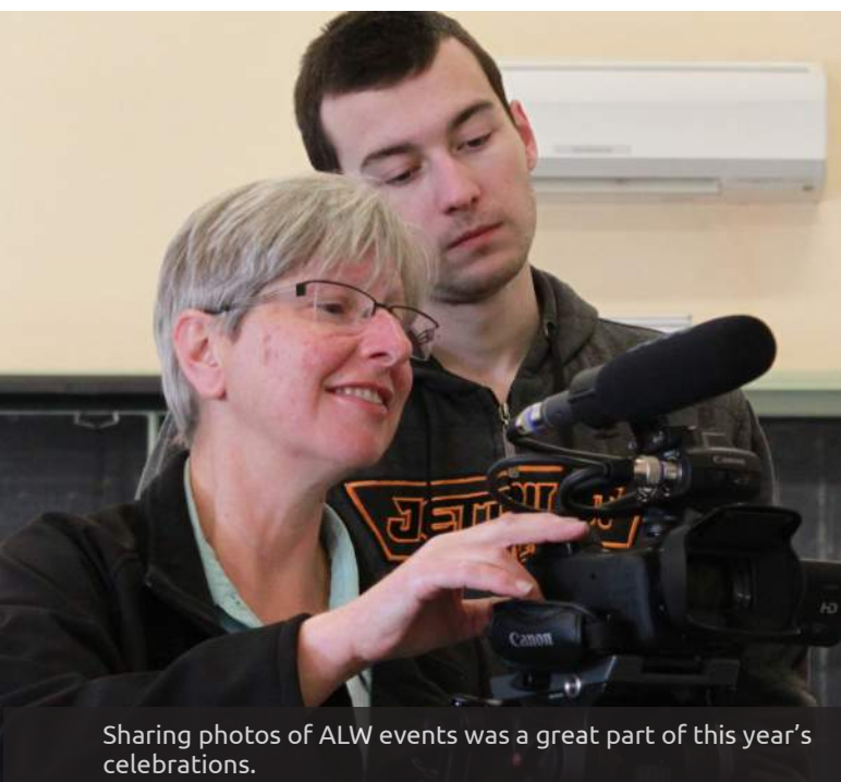
Sharing photos of ALW events was a great part of this year's celebrations.

Over 400 events were held around the country in libraries and loungerooms, classrooms and community centres, indoors and outdoors. Many Australians took part in events from bellydancing to blogging, job hunting to jogging, literacy to languages in a week long festival of adult learning.