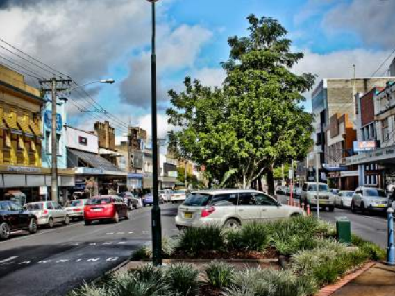
The Human Library brings the community of the country town of Lismore together.