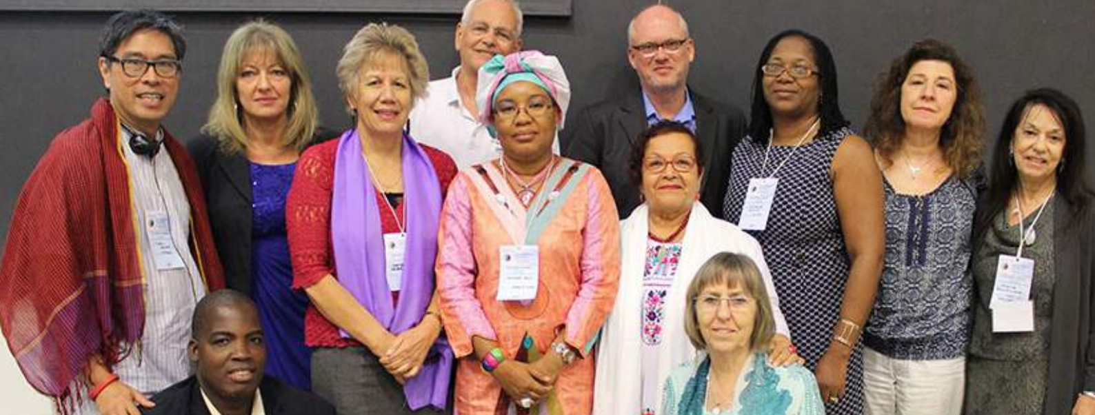
The International Council for Adult Education Executive Committee.