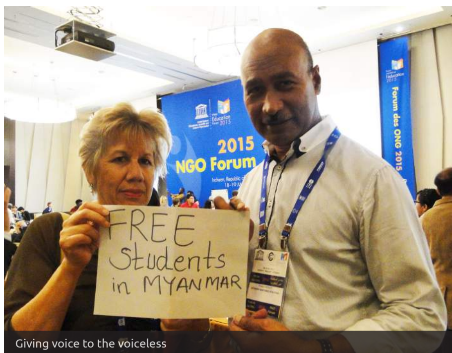
Giving voice to the voiceless