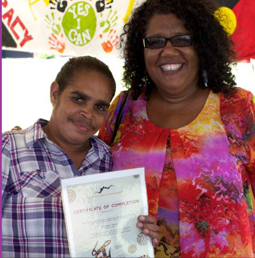
Celebrating achievements at graduation day in Bourke.

A whole-of-community adult literacy campaign based on a revolutionary Cuban education method is having life-changing results in Indigenous communities in outback NSW.