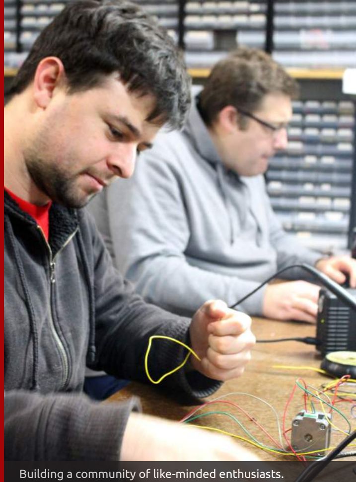
Building a community of like-minded enthusiasts.

Hacker or makerspaces are the latest in a long tradition of community spaces that offer opportunities for informal learning.