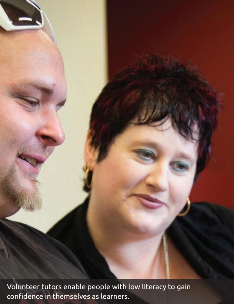
Volunteer tutors enable people with low literacy to gain confidence in themselves as learners.