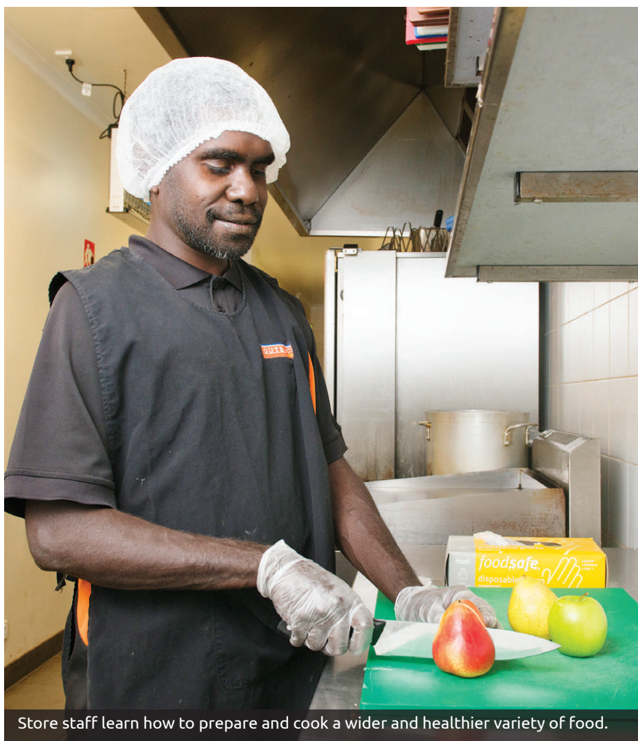
Store staff learn how to prepare and cook a wider and healthier variety of food.

'We work alongside trainees, observing them and talking to them as they go about their work stacking shelves or using the register, asking them to explain what they are doing and why.'