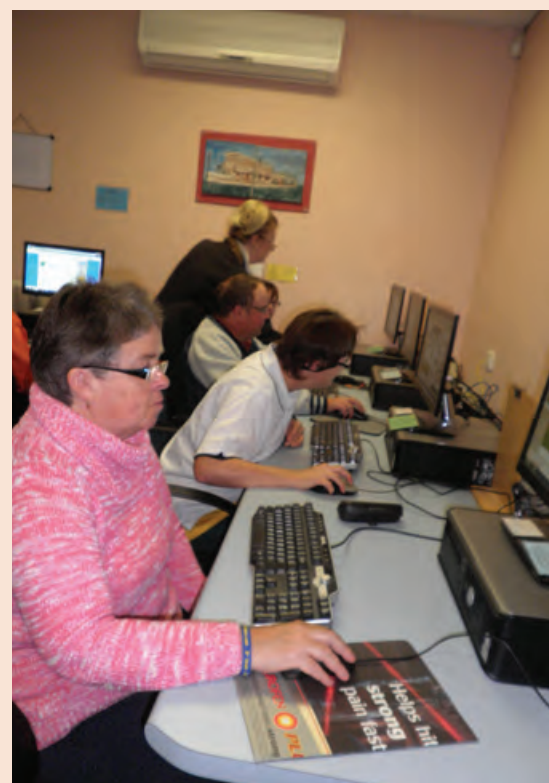
Using computers to develop literacy

Leonie's advice for centres establishing a similar program