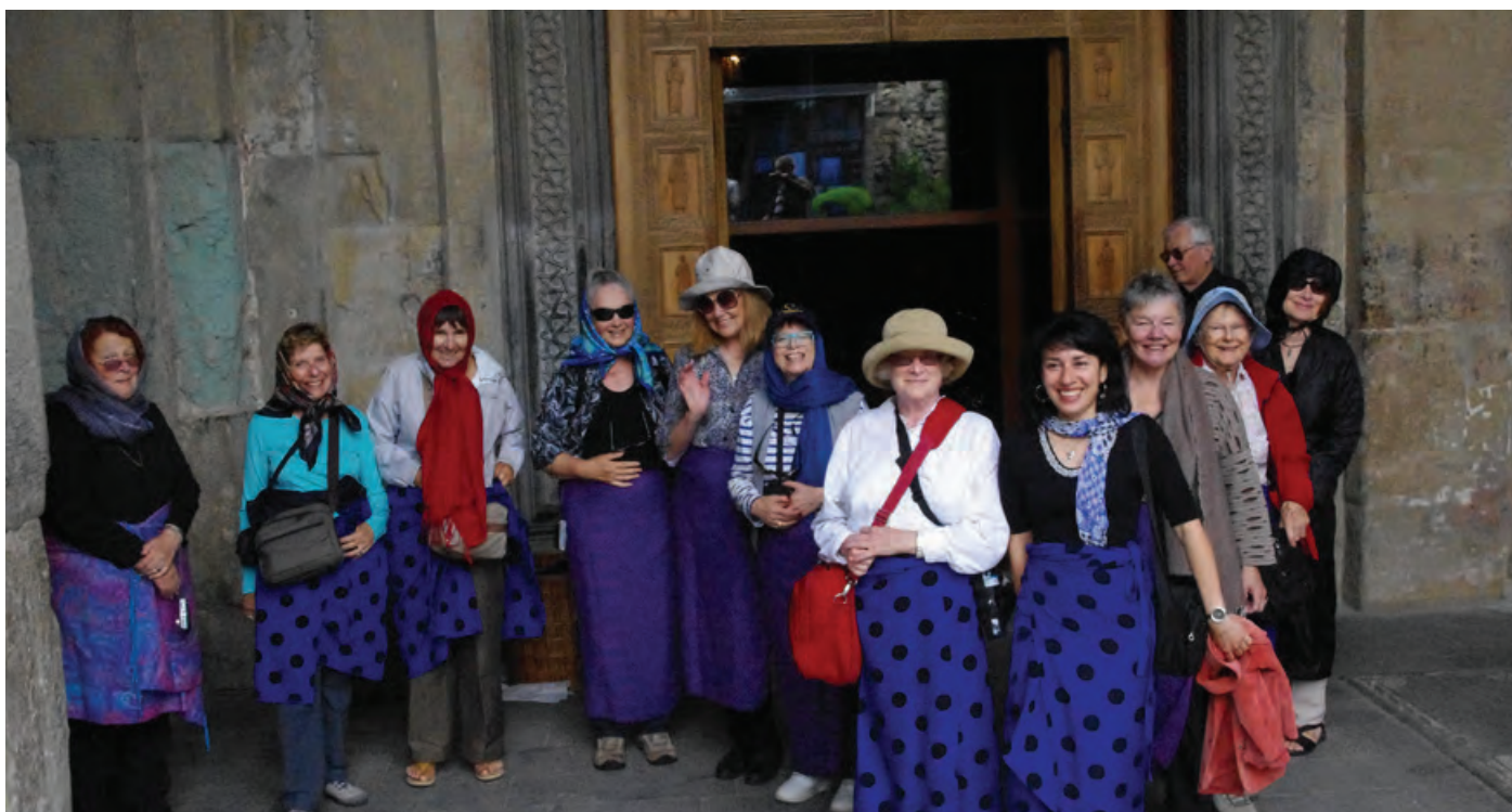
WEA travel group visiting Bagrati Cathedral, Georgia.

Educational tourism is booming. But it's not new in Australia's adult education sector. The WEA in Adelaide and Sydney have a long history of offering courses where students travel with a tutor on trips from Egypt to Estonia, Greece to Greenland.