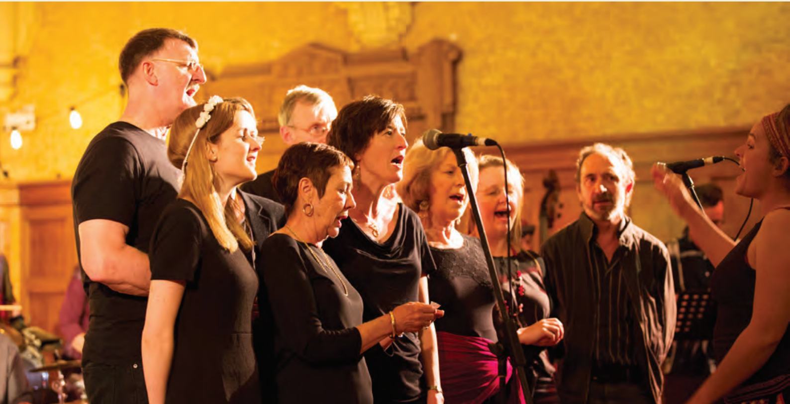
KenSingers.