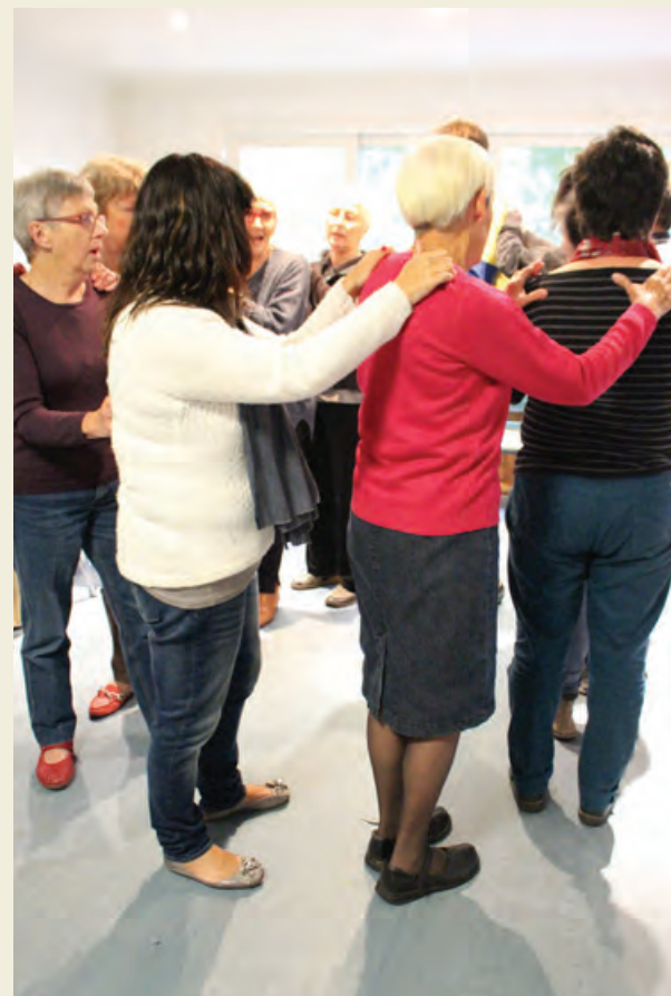
Vocal warm ups