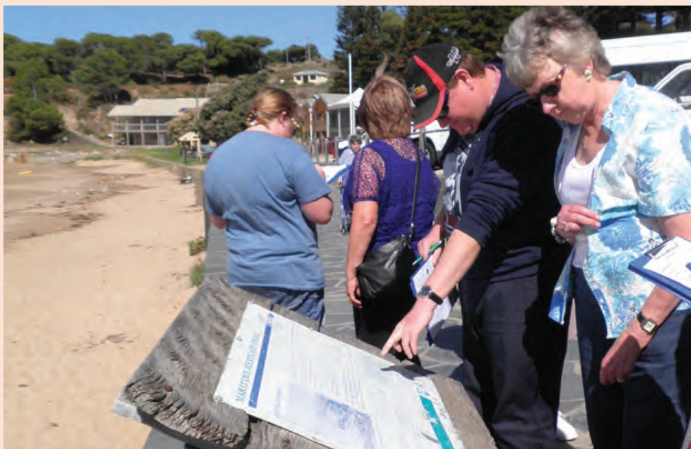
Practising reading signs

is 'Go for it. I hadn't taught people with disabilities before so I was a bit unsure and worried before I started. But once you've established that there's a need for a program like this, it's a matter of getting alongside the students and getting to know the sort of things they respond to, and they will let you know what they need.'