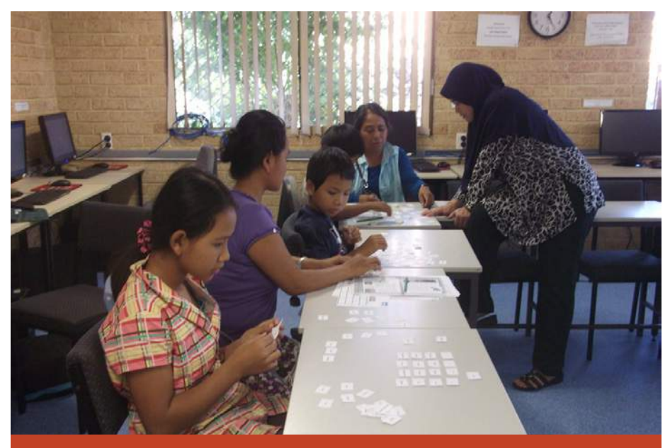
Parents and children learn together.

When a parent can't read or write English, a child often becomes the family interpreter, missing school