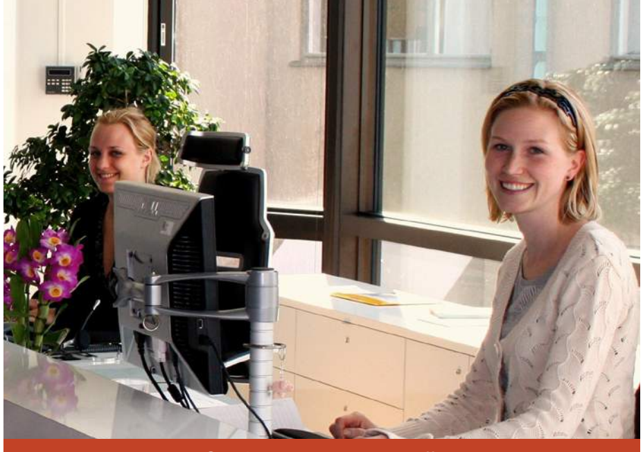
Good management pays off.

Adopt the mindset Understand the role you're taking on and what it means. If staff management is new to you, get training for yourself and others involved to make a successful shift to this role.