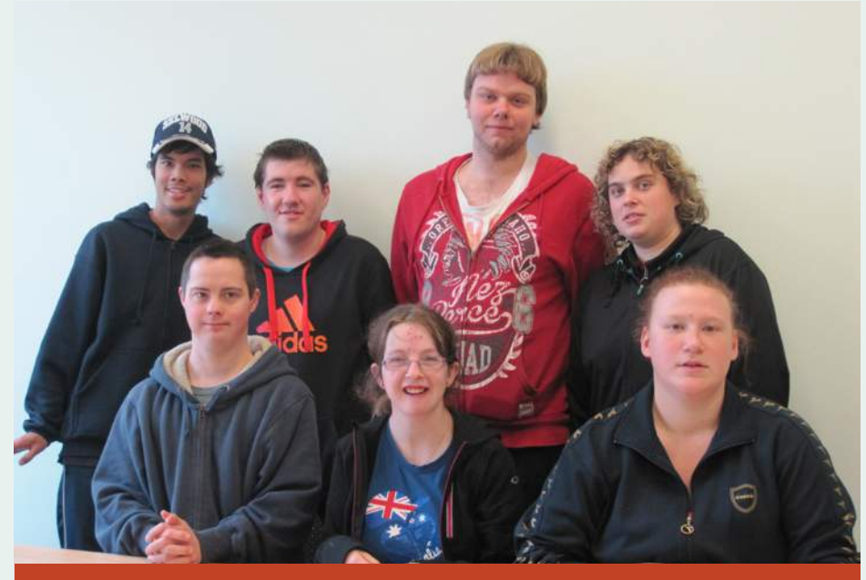
The 'All Abilities Essential Skills' for Work Group.

Organising and running an awards night for a 250-strong basketball team is no mean feat. But the gala event for the Doncaster All Abilities Basketball Competition went smoothly thanks to the behind-thescenes work of a group of students at Pines Learning in Melbourne's Doncaster East.