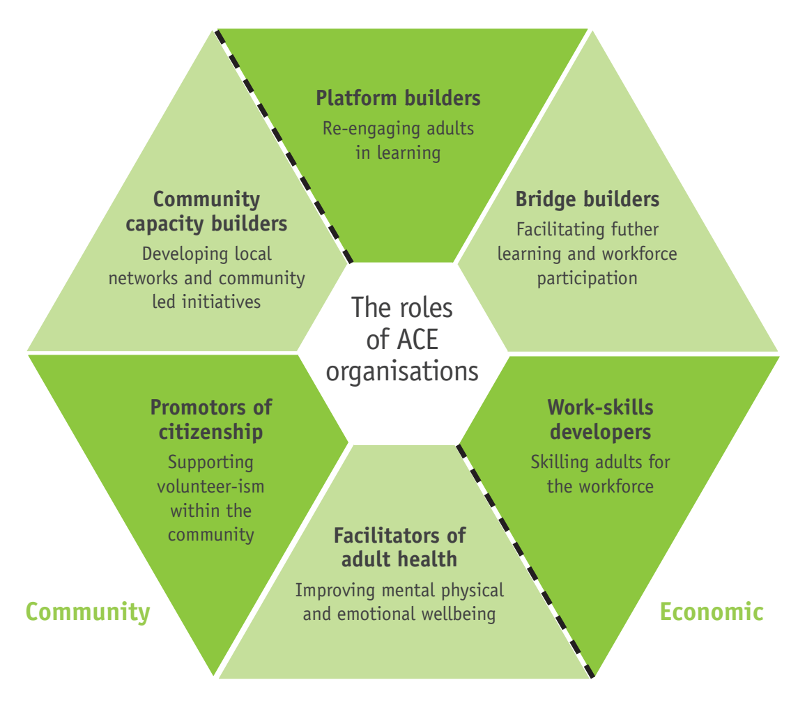
Figure 1: The roles of ACE organisations

ACE plays an important role within the education and training system building both human and social capital. Bowman (2006) outlines these roles below:<sup>9</sup>