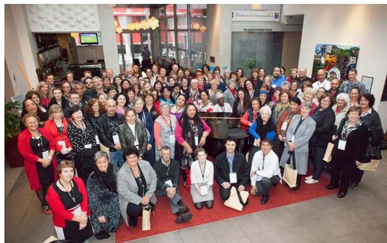
Over 120 delegates from Australia and New Zealand

The workshop program was organised around two themes – citizenship