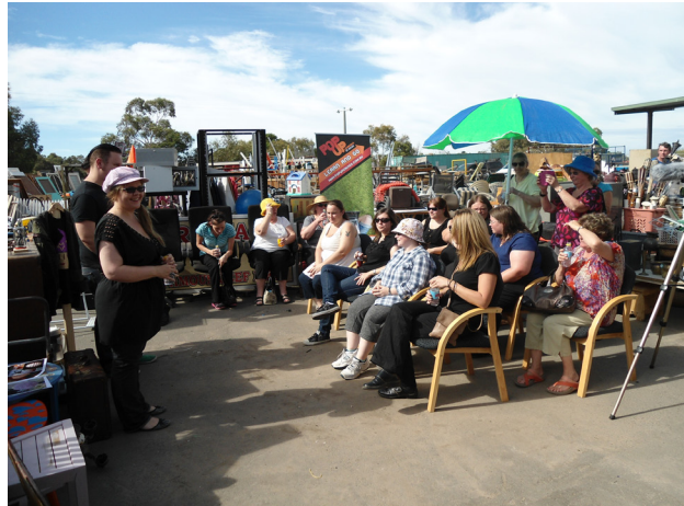
Upcycling class at the Knox transfer station

Given the success of pop up businesses – where businesses take advantage of empty buildings to open a short term pop up shop – the idea of offering classes along the same