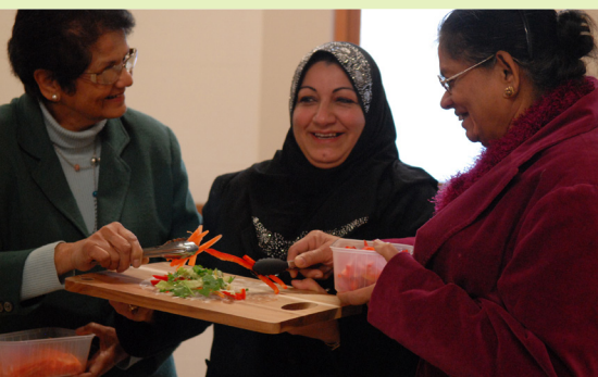
Sharing and enjoying one another's cooking