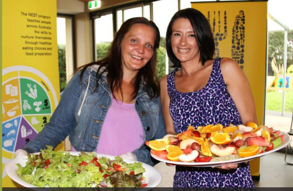
OzHarvest's NEST program promotes healthy eating and nutrition and encourages ways to minimise the impact of waste on the environment.

Food rescue charity OzHarvest is running an education program for people on low incomes to learn about cooking healthy food on a budget.