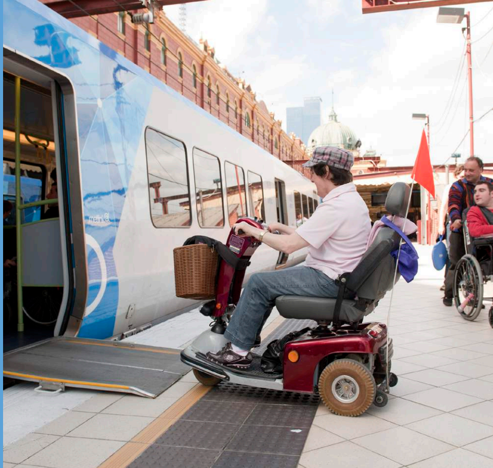
The NDIS aims to enable people with disabilities to participate in ordinary life.

The National Disability Insurance Scheme (NDIS) is the biggest social reform in Australia since the introduction of Medicare.